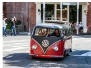
Classic car parade returns